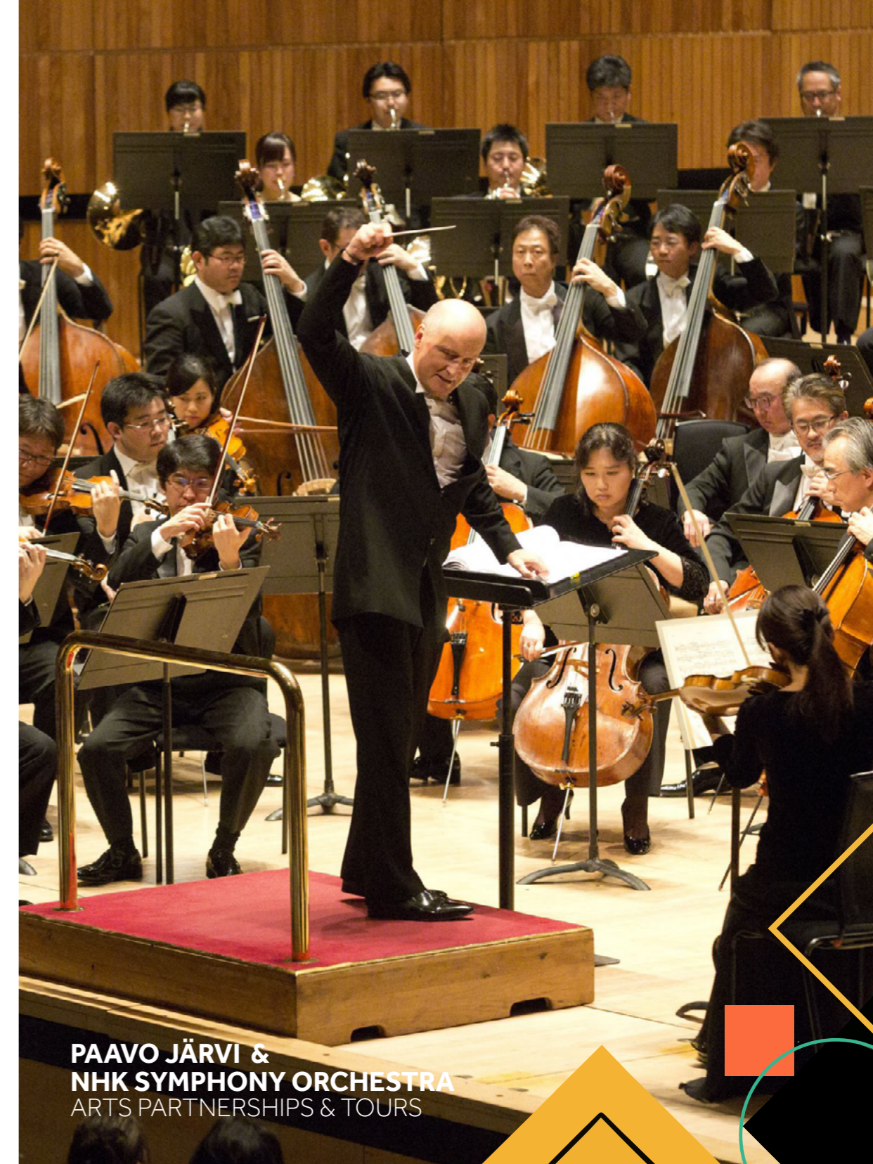
PAAVO JÄRVI & NHK SYMPHONY ORCHESTRA ARTS PARTNERSHIPS & TOURS

NHK Symphony Orchestra NYO Canada O/Modernt Chamber Orchestra Orchestre de Chambre de Paris Orchestre de Paris Orchestre Philharmonique Royal de Liège Oslo Philharmonic Philharmonia Orchestra Philharmonisches Staatsorchester Hamburg Rotterdam Philharmonic Royal Concertgebouw Orchestra Royal Liverpool Philharmonic Orchestra Royal Philharmonic Orchestra Royal Stockholm Philharmonic Orchestra Scottish Ensemble Sinfonieorchester Wuppertal Spira mirabilis St Louis Symphony Orchestra Swedish Chamber Orchestra Tonhalle-Orchester Zürich Trondheim Solistene Wiener Philharmoniker