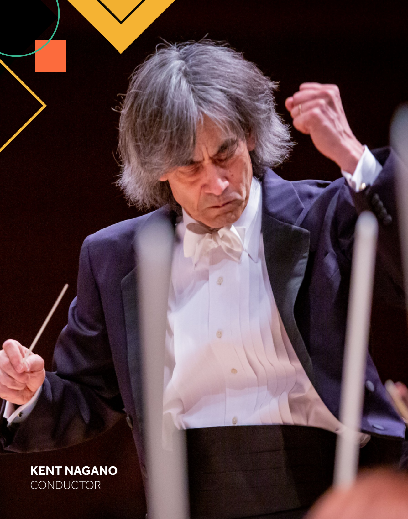
KENT NAGANO CONDUCTOR