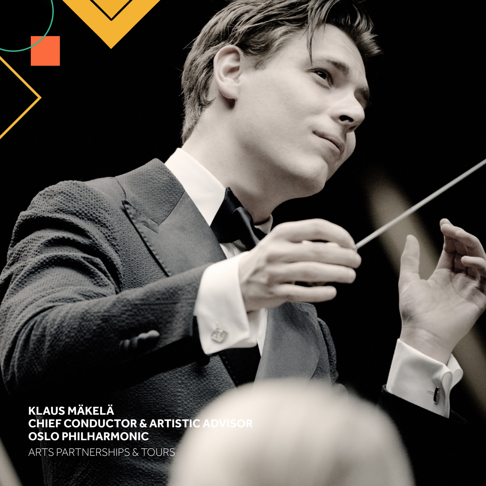
KLAUS MÄKELÄ CHIEF CONDUCTOR & ARTISTIC ADVISOR OSLO PHILHARMONIC ARTS PARTNERSHIPS & TOURS