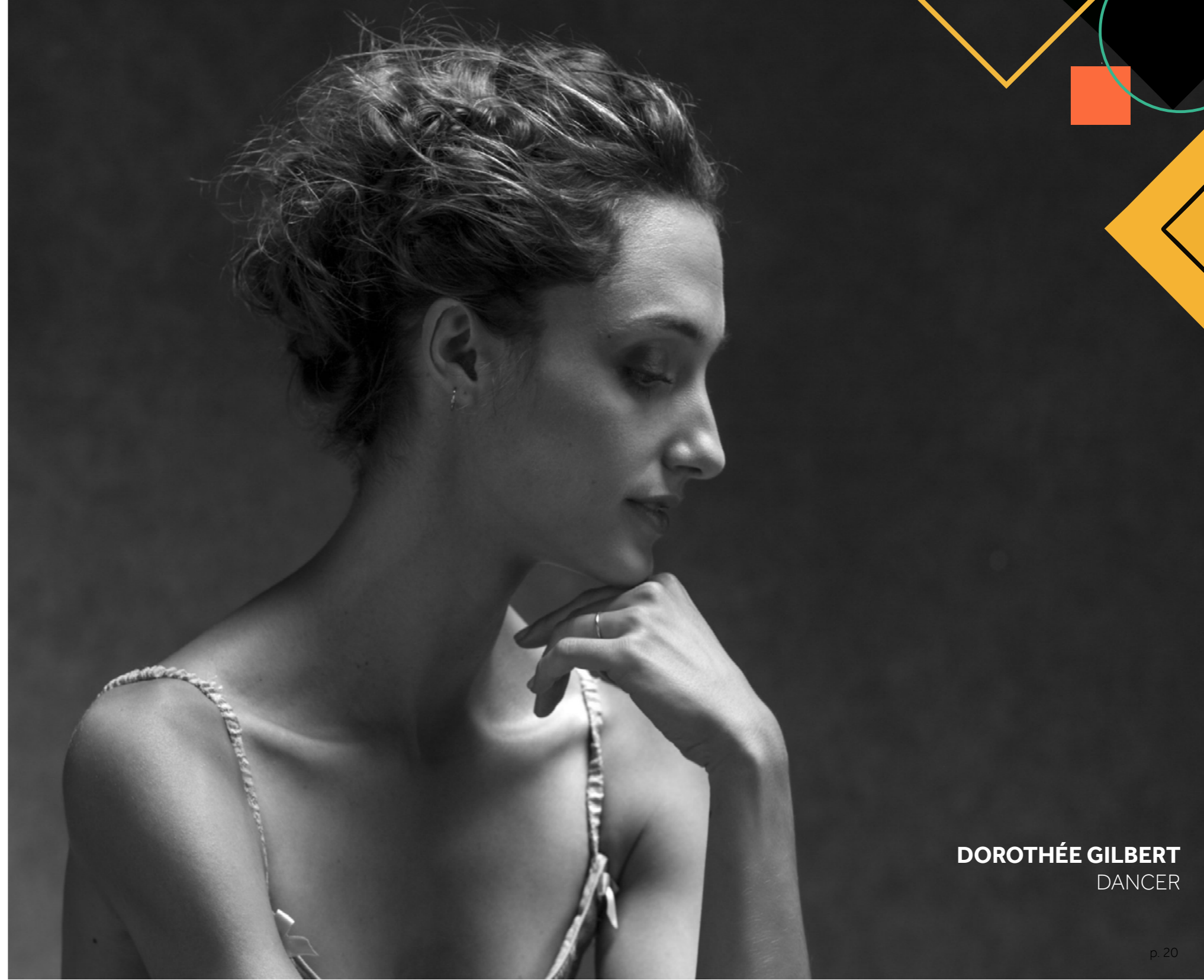
DOROTHÉE GILBERT DANCER

We provide services for dancers, choreographers, specialist ballet conductors and individuals complimentary to the world of dance. Our experienced and dedicated team of dance specialists have a long history and established track record within the world of dance. We aim to give tailored support and advice to our clients whilst continuing to build and expand our network and relationships and explore connections in untapped cultural markets.