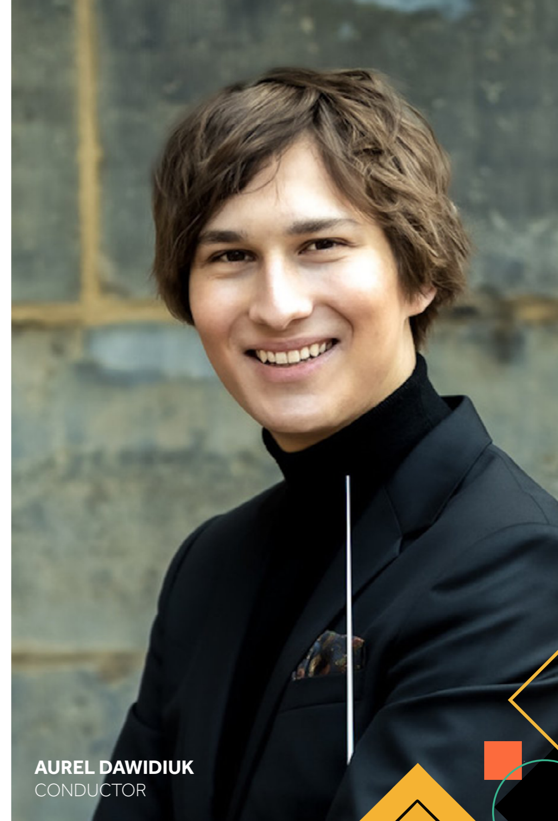
AUREL DAWIDIUK CONDUCTOR