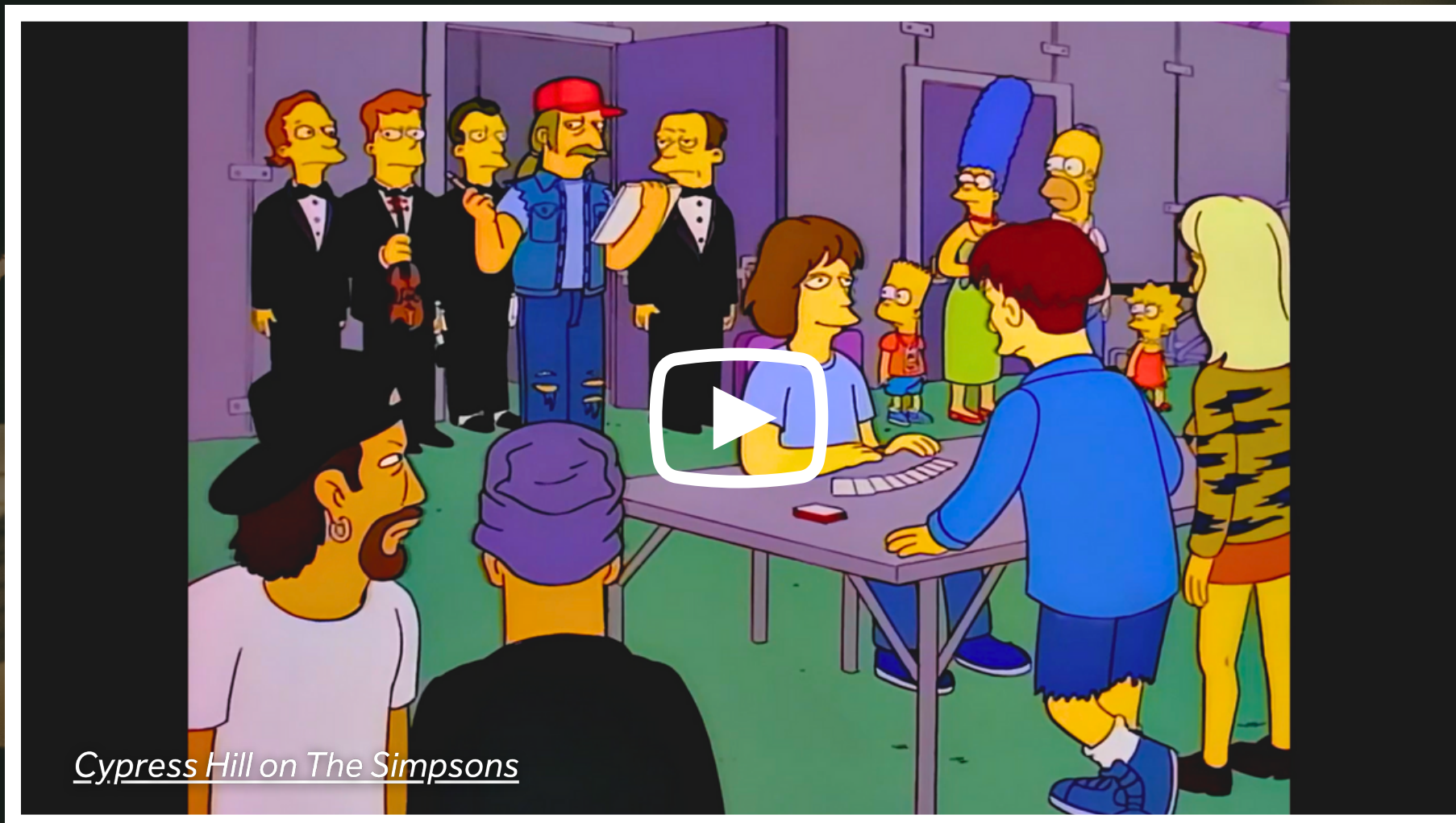
Cypress Hill on The Simpsons

In 1996, one of the most-watched TV shows in the world, The Simpsons, joked that Cypress Hill had accidentally booked a gig with the London Symphony Orchestra while under the influence. Now, for the 30th anniversary of their famous album Black Sunday, that joke is becoming an exciting, dynamic reality. With 21 new orchestral arrangements of their most iconic songs, Cypress Hill: Symphonic Live is a living, breathing demonstration of defying expectation and building something truly original.