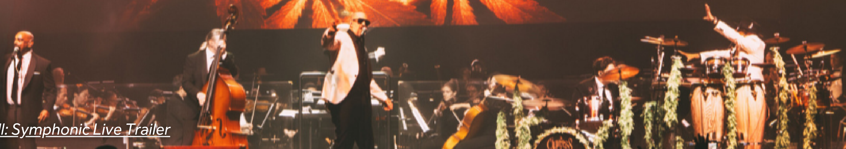
Cypress Hill: Symphonic Live Trailer